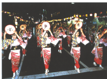
Hanagasa Festival, Yamagata

[Contact] Sendai Tanabata Executive Committee, tel: (022) 265-8181