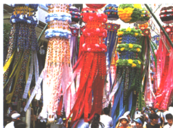
Sendai Tanabata Festival, Sendai

[Contact] Executive Committee of Morioka Sansa Dancing, tel: (019) 624-5880