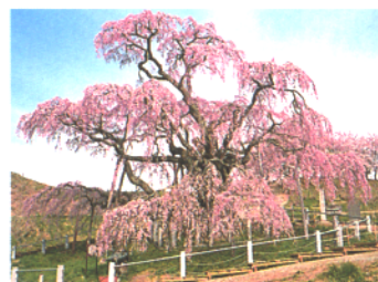
Miharu Takizakura, Miharu

Contact: Nan-yo City Tourism Assn., tel: (0238) 40-2002 Shirataka Town Tourism Assn., tel: (0238) 86-0086 Nagai City Tourism Assn., tel: (0238) 88-5279