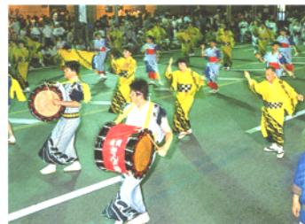
Morioka Sansa Odori, Morioka

[Contact] Akita City Kanto Festival Committee, tel: (018) 866-2112