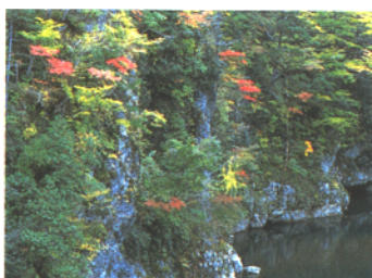
Daki Gaeri Valley, Tazawako & Kakunodate

[Contact] Towadako General Affairs Center, tel: (0176) 75-2506