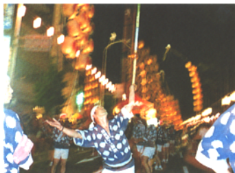
Kanto Festival, Akita

[Contact] Aomori Tourism and Convention Assn., tel: (017) 723-7211