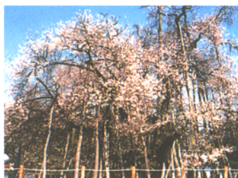
Okitama Cherry Blossom Roads/Kubo Zakura, Nagai

Contact: Ogawara Business and Tourism Bureau, tel: (0224) 53-2507