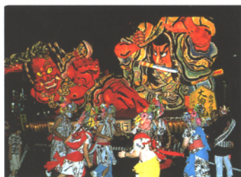
Aomori Nebuta Festival, Aomori