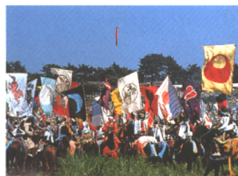
Soma Wild Horse Chase, Haramachi, Soma, Odaka

[Contact] Yamagata Prefecture Hanagasa Council, tel: (023) 642-8753