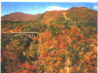
Naruko Gorge, Naruko

[Best viewing] Mid Oct. to early Nov. [Access] From Ichinoseki, 35 km via Rte. 342 [Contact] Ichinoseki Commerce and Tourism Bureau, tel: (0191) 21-2111