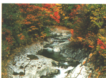
Nakatsugawa Valley, Kita Shiobara

[Contact] Tozawa-mura Tourism Assn., tel: (0233) 72-2111