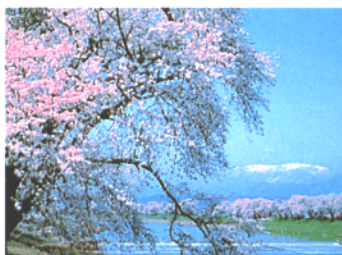
Hitome Senbonzakura, Ogawara

Contact: Kitakami Sightseeing Assn., tel: (0197) 65-0300