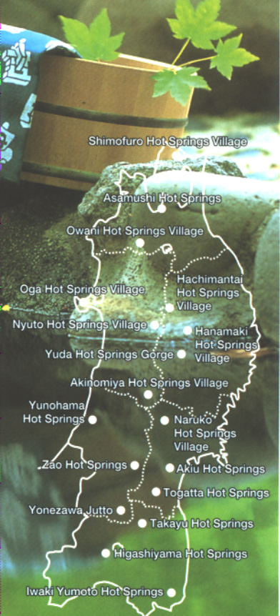
Shimofuro Hot Springs Village

[Contact] Azuma Takayu Tourism Promotional Assn., tel: (024) 591-1125