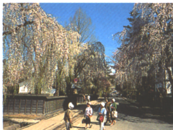
Kakunodate Samurai Residences, Kakunodate

Contact: Hirosaki City Sightseeing Information Center, tel: (0172) 37-5501