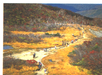
Mount Kurikoma (Sukawadake) Ichinoseki

[Contact] Folake, Tazawako Tourism Information Center, tel: (0187) 43-2111