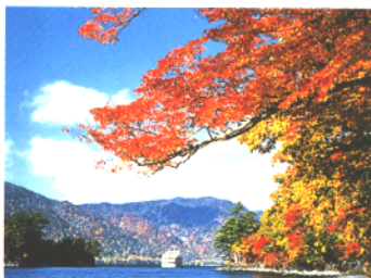
Lake Towada & Oirase Gorge, Towadako

Be inspired by the artistry of nature, which paints the landscape in beautiful hues of red, yellow, and orange.