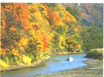
Mogami Gorge, Tozawa

[Contact] Naruko Tourism & Hotel Info. Ctr., tel: (0229) 83-3441