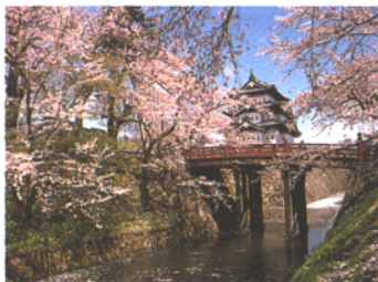
Hirosaki Park, Hirosaki

Captivatingly delicate blossoms in full bloom. Enjoy the enchantment of spring at a place you've always longed to visit.